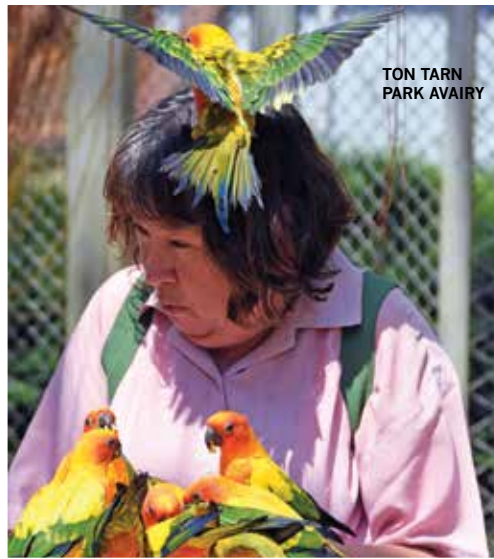
TON TARN PARK AVIARY