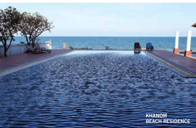
KHANOM BEACH RESIDENCE

Khanom's major attractions are the amazing 'pink dolphins' technically known as Indo-Pacific humpback dolphin Sousa chinensis which grow to almost three metres in length. There are 2,000