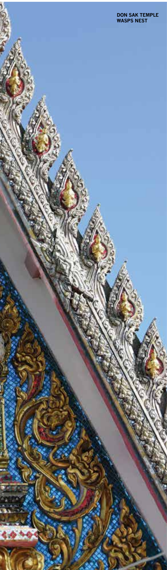
DON SAK TEMPLE WASPS NEST