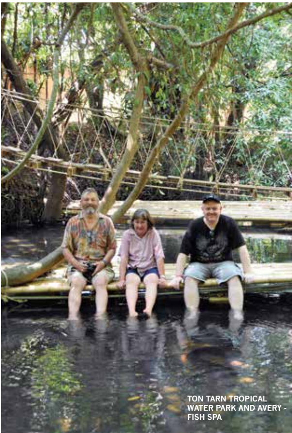
TON TARN TROPICAL WATER PARK AND AVIARY - FISH SPA

Unique is an overused word, but Ai Kai Wat Chedi Temple is indeed, truly unique!! The drive was about 50 kilometres, but well worth it. You can't miss the temple as you simply follow the dozens of 3-metre tall roosters that are placed every 100 metres on the road from the Nakhon Si Thammarat Highway to the temple. Legend has it that novice monk Ai Kai was looking after Wat Chedi but died at a young age. His spirit took over his role and is still