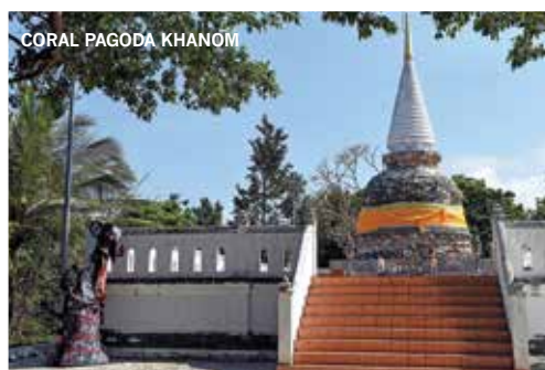
CORAL PAGODA KHANOM