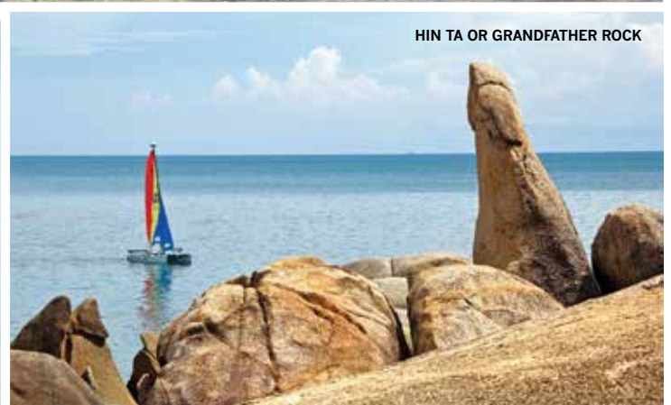
HIN TA OR GRANDFATHER ROCK