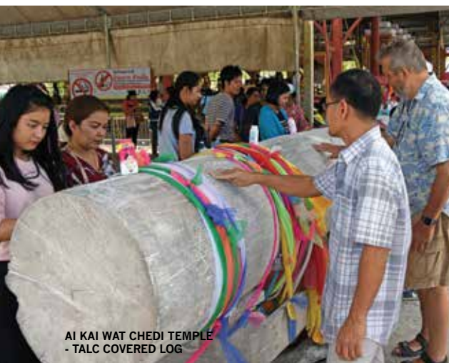
AI KAI WAT CHEDI TEMPLE - TALC COVERED LOG